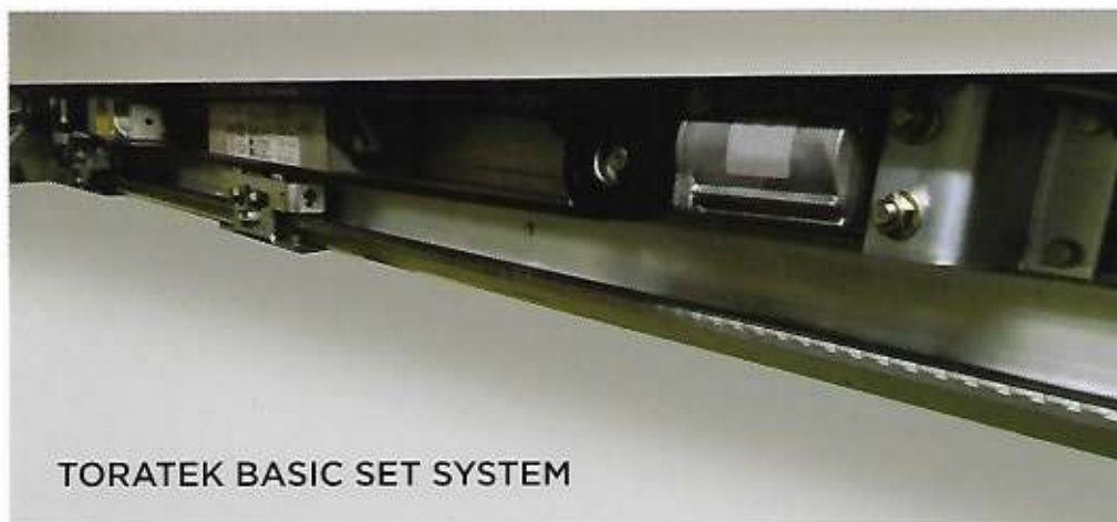
TORATEK BASIC SET SYSTEM

Based on famous and proven high-quality system, installed at thousands of locations. We have systems for light residential doors to heavy warehouse doors. We have installed and delivered 100% proven systems.