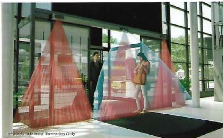
Infrared Curtain for Illustration Only