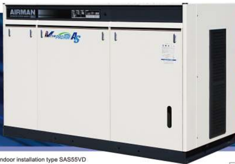
Indoor installation type SAS55VD